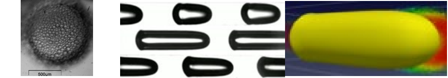
Generation of armored bubble High-speed images CFD Experiment and CFD of microchannel flow